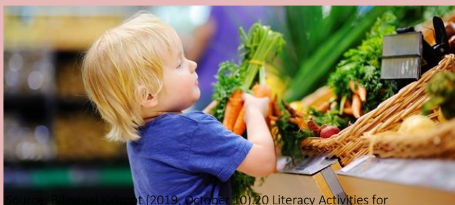
Source: https://bilingualkidspot.com/2019/05/20/literacy-activities-for-preschoolers-kindergarten-toddler/ (2019, October 10). 20 Literacy Activities for Preschoolers. Retrieved from https://bilingualkidspot.com/2019/05/20/literacy-activities-for-preschoolers-kindergarten-toddler/